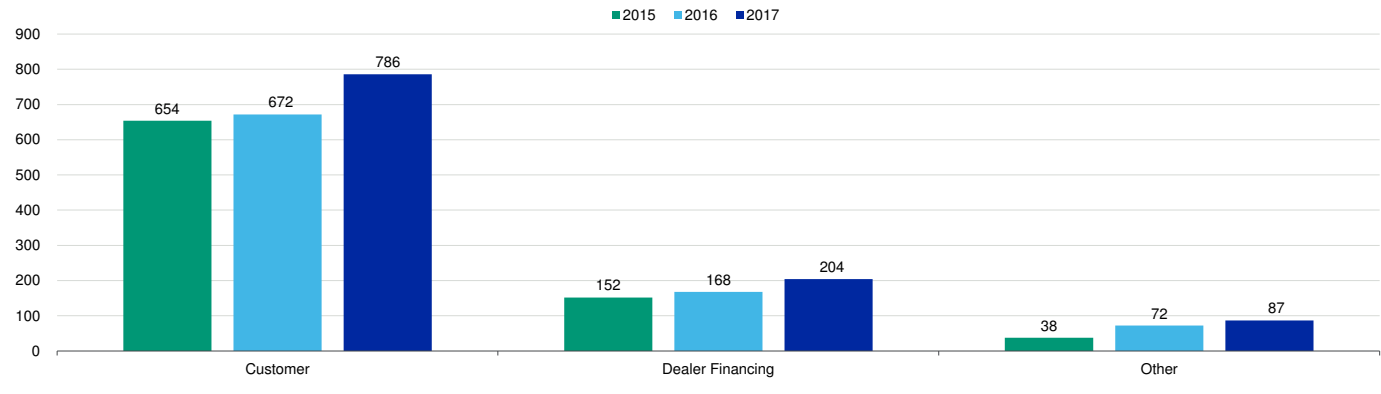
Profit before tax per business segment (consolidated, in € Million)