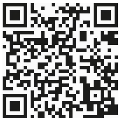
WhistleB QR Code

You will find the list of network members on the Renault Group intranet, at the bottom of the home page in the "Useful links" "Ethics and Compliance" section « Who are we?».