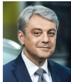
Luca DE MEO Chief executive officer

A handwritten signature in black ink, appearing to read 'J.D. Senard'.